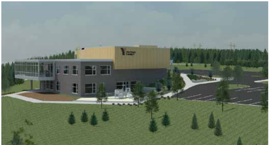
View From The East