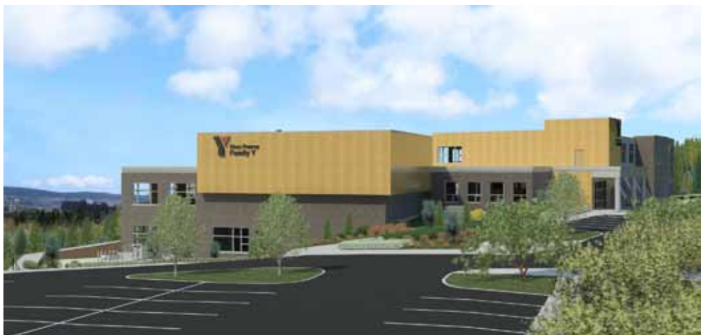
View From The Northeast